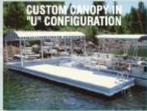
BROCK DOCK DECKING & OPTIONAL WATERCRAFT LIFT